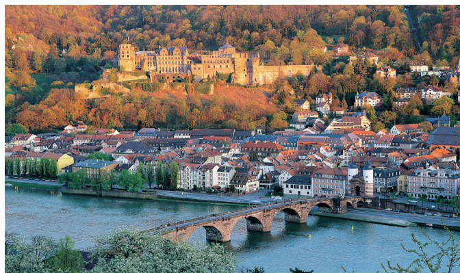
Heidelberg, Germany

If you need further information, please write an e-mail to info@eric-etn.eu or visit www.eric-etn.eu/eric-cash2-final-conference/